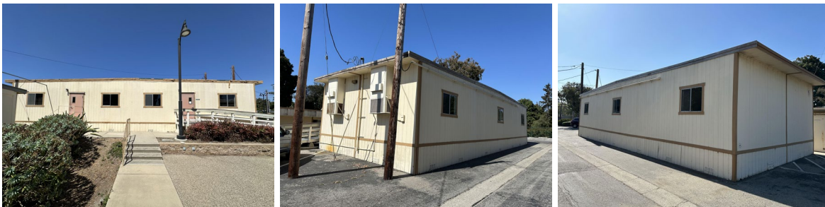
Figure 1. Existing Exterior Of The Annex Building

Should any work inadvertently be omitted that would preclude completion of all work associated with this project, please advise the CM prior to submission of your proposal.